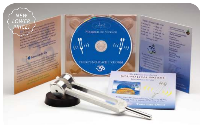
INTRO TO SOUND HEALING SET UPC: 855805001000 $69.95

In the final article coming in the August issue of New Leaves , we'll take a closer look at the four Sound Healing CDs that accompany the Ohm Therapeutics system. These musical recordings harmonize with the sound vibration of the Ohm Tuning Forks, enhancing their healing resonance. These pioneering works continue to influence musicians and health care practitioners as they explore the healing benefits of a tone associated with the Earth.