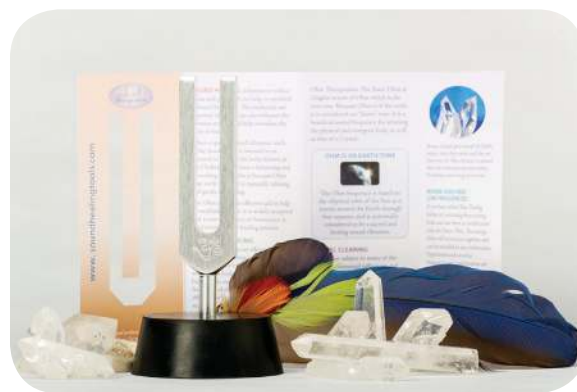
SONIC OHM KIT UPC: 855805001109 $54.95

Ohm Therapeutics offers a range of beautifully packaged Ohm Tuning Forks (made in the USA), tuning fork Activators, and a popular laminated Tuning Fork Primer Chart for self-treatment and treating others. Ohm Tuning Forks, Crystal and Tibetan-style bowls, and music in the key of Ohm™ provide a means to access vital energy and to resonate with the Earth for health and well-being. Through the use of one tone, Ohm, and octaves that move higher and lower on the Axis of Ohm , anyone who chooses can “tune in” to the good vibrations. Resonating with this earth-tone is abundantly beneficial. Ohm is an axis, a continuum of vibratory source energy. Ohm activates the Qi and nourishes the natural current flowing through our bodies. For rejuvenation and healing, remember, There's No Place Like Ohm™ .