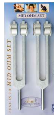
MID OHM KIT (left) UPC: 855805001024 $59.95