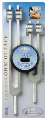
HIGH OHM SET (left) UPC: 855805001864 $98.00