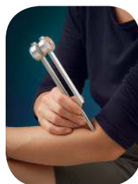
Mid Ohm Tuning Fork

In the world of tuning forks, there are many frequencies marketed for the healing of body and soul, for tuning the brain and other organs, the DNA, and pineal gland, for creating a bridge to heavenly realms and even tuning to the frequency of love. It is the Wild West of Sound Healing, and there is something for everyone.