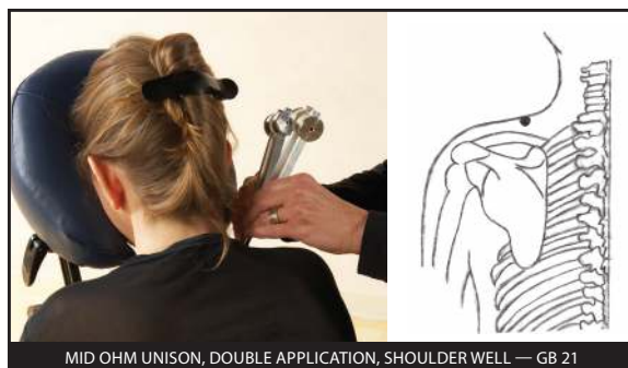
MID OHM UNISON, DOUBLE APPLICATION, SHOULDER WELL — GB 21

The Axis of Ohm diagram below shows the various Ohm octaves recommended and their corresponding hertz frequencies. Each Ohm Octave Set includes instructions with photos and illustrations demonstrating use, and treatment applications featuring well-known acu-points and anatomical placements. The High Ohm Octave includes photos and application techniques (rolling, sweeping, figure-8) for the subtle body, Sound Layering, and an introduction to the Feng-Shui of Sound. While suitable for professional use, Ohm Therapeutics also offers an Introduction to Sound Healing Set and the Mid Ohm Kit for newcomers to Sound Healing with tuning forks.