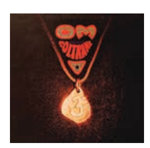
Om (Impulse! 1968)